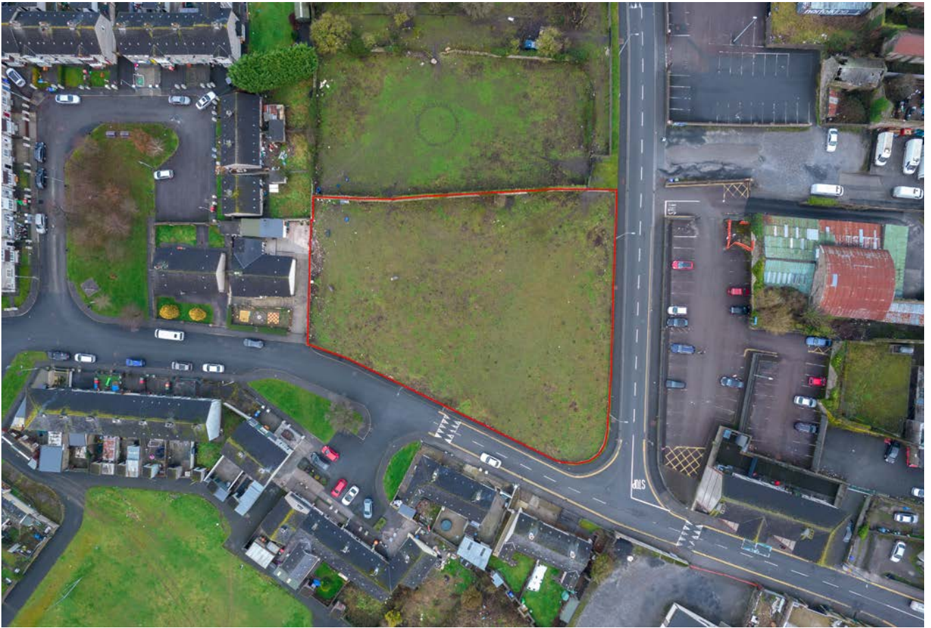
Lands at Gantly Road, Roscrea