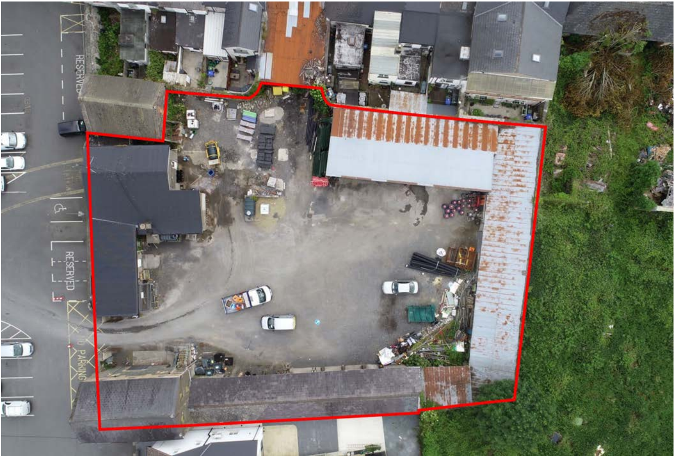
Old Fire Station, The Commons, Castleblayney