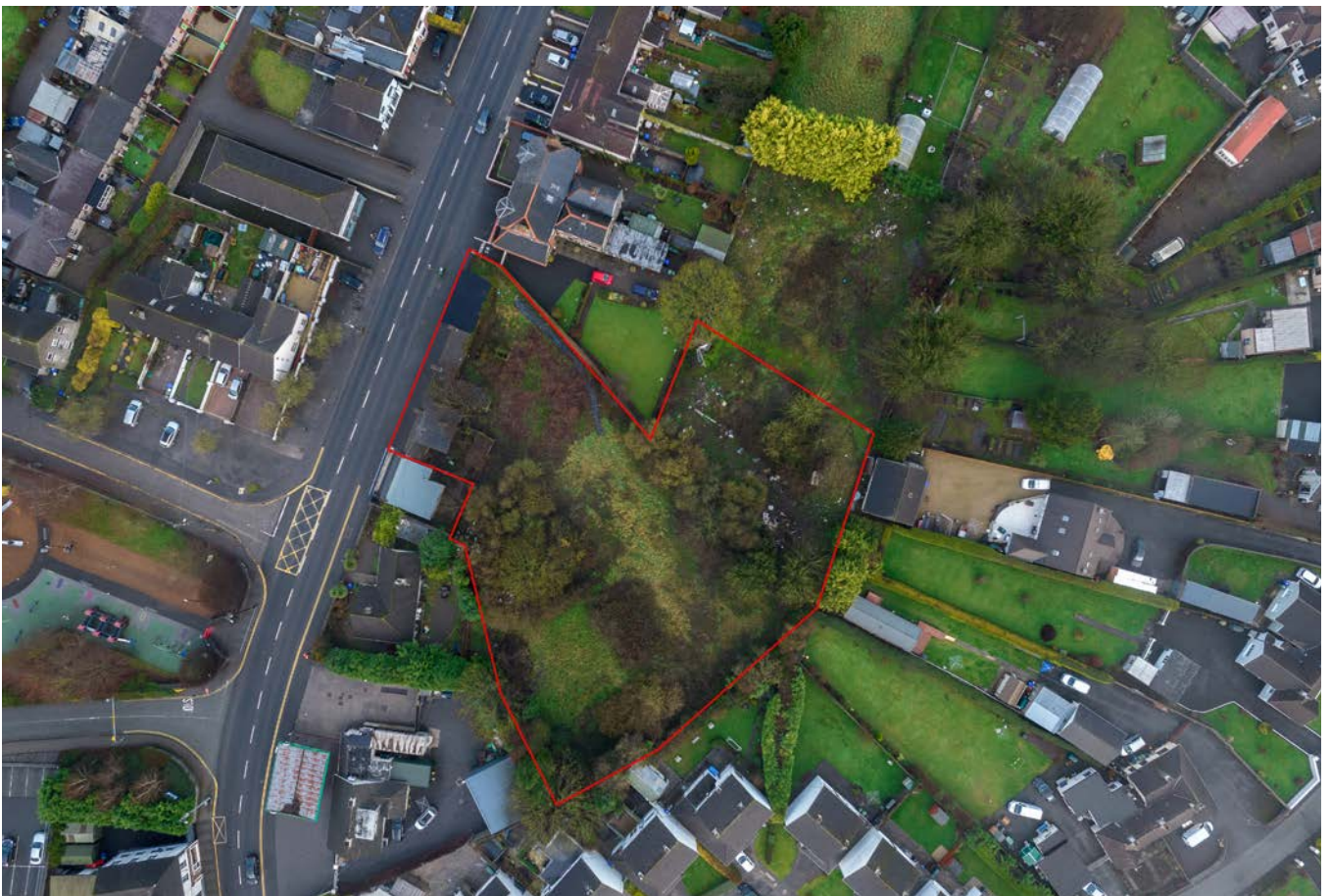
Lands at Station Road, Kildare Town